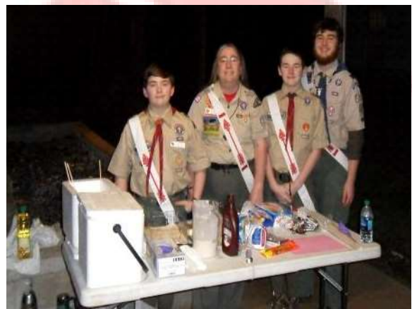
"Deep Fry-Everything" Fellowship Meet-N-Greet