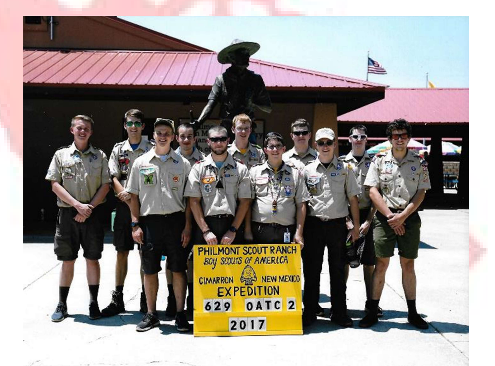
2017 Lodge Chief