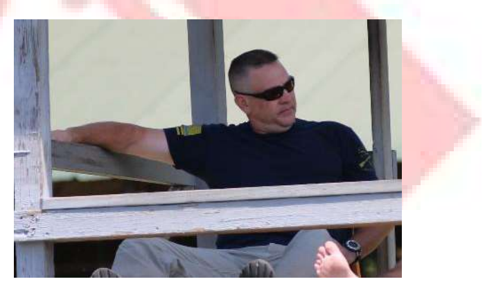
Mowogo Lodge Adviser