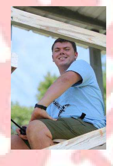
2017 Vice Chief of Membership