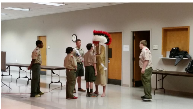
Lau-In-Nih Chapter's Spring Tapout!