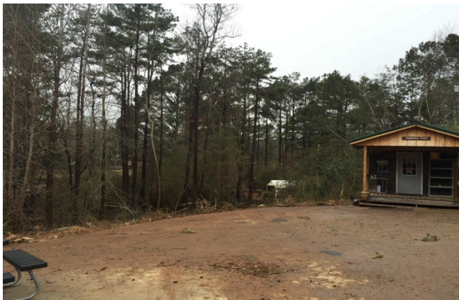
Chain saws, a tractor, and a lot of cheerful service.