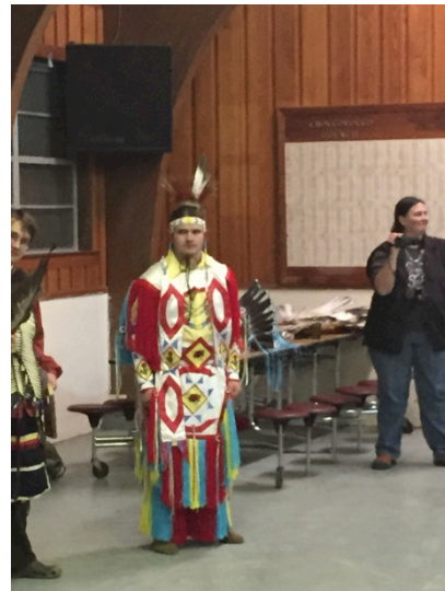
SWAG, Lets Dance 2015!