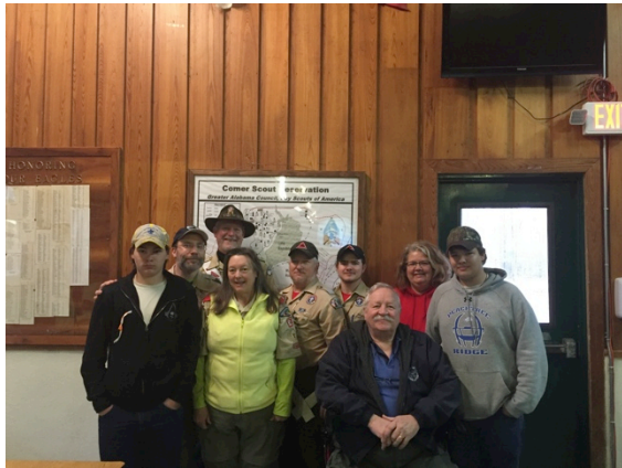
SWAG! Where were you?