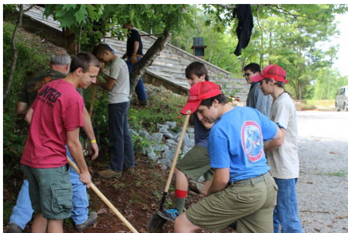
Machque Chapter Work project