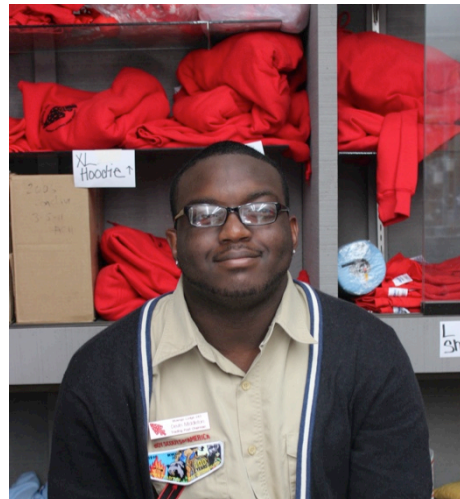
Did you see Devin at the Trading Post?