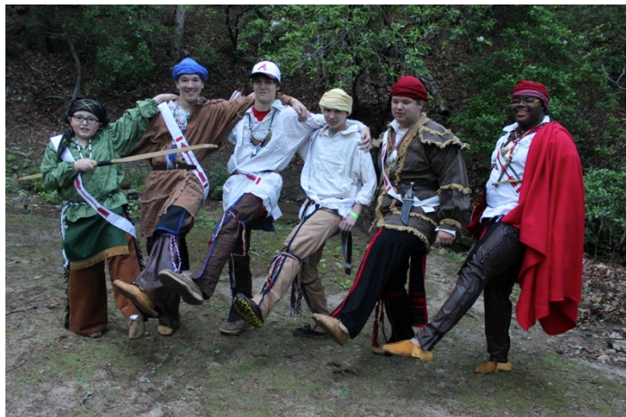
Mowogo - Pre Ordeal ceremonialist