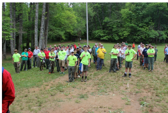
Lunchtime Ordeal Candidate Style