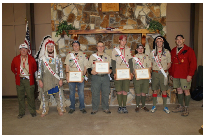
Mowogo Vigil Honor Recipients