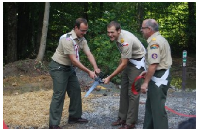
Cutting of the ribbon at the Arrowhead Trail Dedication. (Check out the whole crew on page 4.)